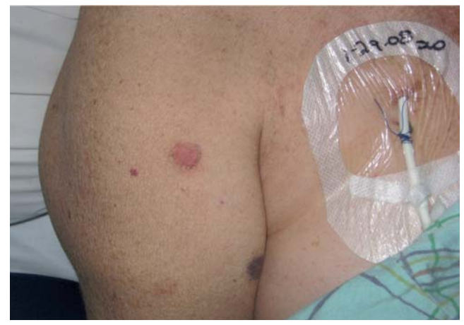
Figure 1 Skin lesions that developed acutely in a profoundly neutropenic woman who had received an allogeneic stem cell transplant 53 days before. The upper lesion was nodular and the lower one purpuric; both were painful.